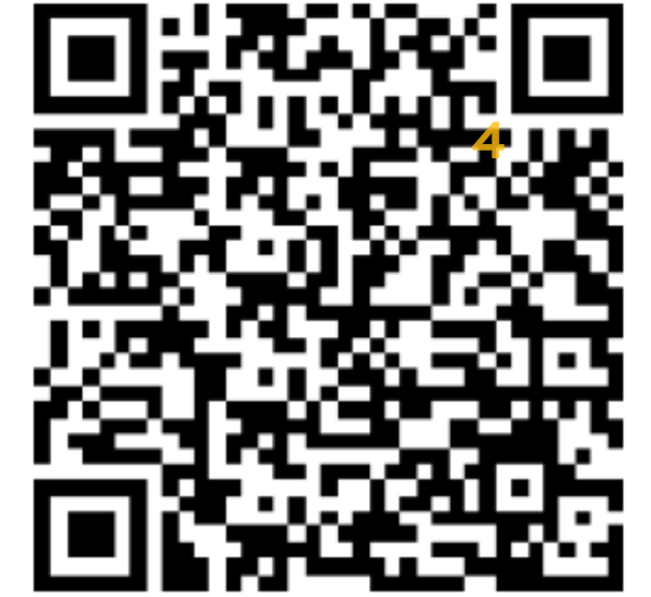
Sign-up QR code

Participating in Kind30 is simple. Here's how: